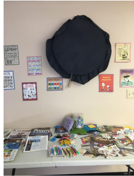
Ihuaqtikhat uvanga Aqnarutit Uqatiaqngiginik Hanauyaattut hulijutayuyumi

ilihaqviani ayuuniqaqtut 10-mik ilihagtut uqavvigiyaahimaliqtuq aaniaqnaqmitunik inuqatiriigutunik auyamilu hulijutunik atuqhimayumi Niqiliqvikmi pikipagaayuq aqnarutinit 8-nit 12-mut ukiuqaqtunit taiyauyuq Aqnarutit Uqatiaqngiginik Hanauyaattut . Atuqtilugu havaaq, uqauhiqaqtut hunanik aaniaqnaqnitunik inuqatiriigutunik ilanariyamiknik qatangutimikniklu. Taja havaqatiqaqtut nunagiyayuyumi aaniqnaqnit qimaaviknik munaqhvilitik Aqnat Ikayuqtauniginik Piqatiriinit Aipiutiguraagat Hitamiummilu uubluumaat.