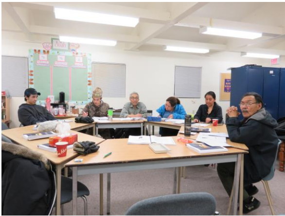
CFSC-nik Ayuiqhaniq Hanirayakmi

CFSC-guyuuq Ihuqaqhaqhimayut ikayuuqtiqaqtunik aviktuqhimayunit ukiuqtaqtumilu, kanatamilu timiuyunit ihumagiyaqaqtunik hiqutit aaniqnainiganik, amihulu hiqutininik angunahuaqtilu ilihautikhanik ilihaiyinit humiliqaa Kanatamit. Hunaqaqngit uuma ilihautikhap munariyauyuuq agiqaqtavakhunilu Piliihimanit Kanatamiutat Hiqqutiliqinikut Havaaganit