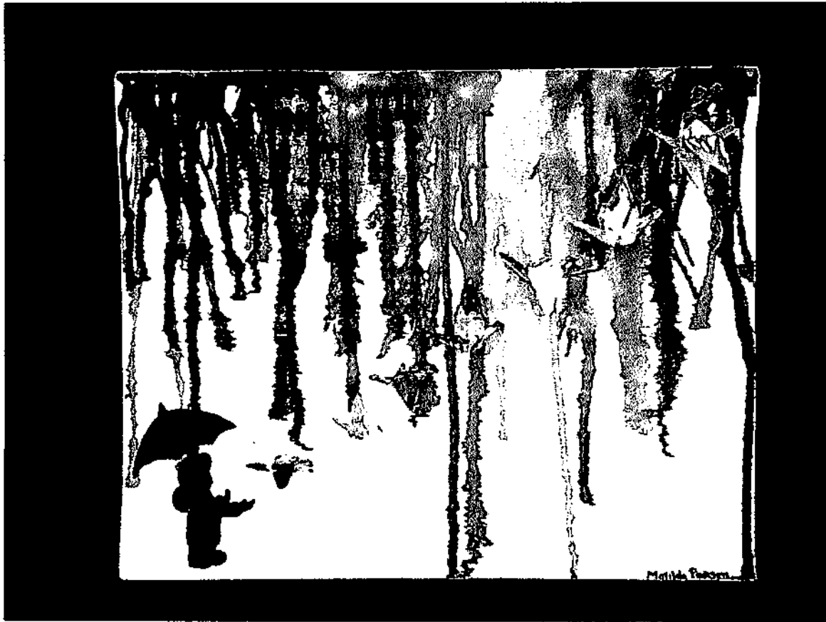
“Ըմբռնումը և ձյանը հարգելով” Երվանուհի ԼՆՈՒՄ Առնչում

Ուղեգրերի ձյանը հարգելով և ներդրումը կատարելով մանրաբանական և մանրանկարչական